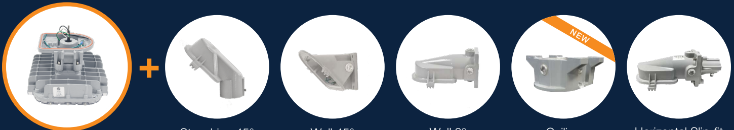
UMA Area Light